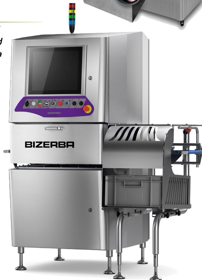
PackSecure L: Combination of seal check and label check in a standalone device