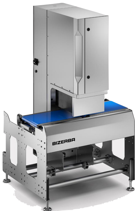
LabelSecure: Efficient control of packagings and labels applied to them