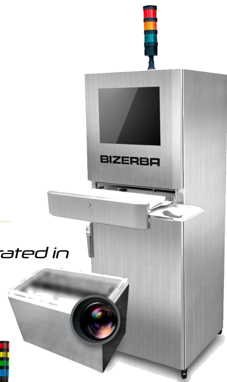
PackSecure T: Seal and label inspection integrated in thermoforming machine