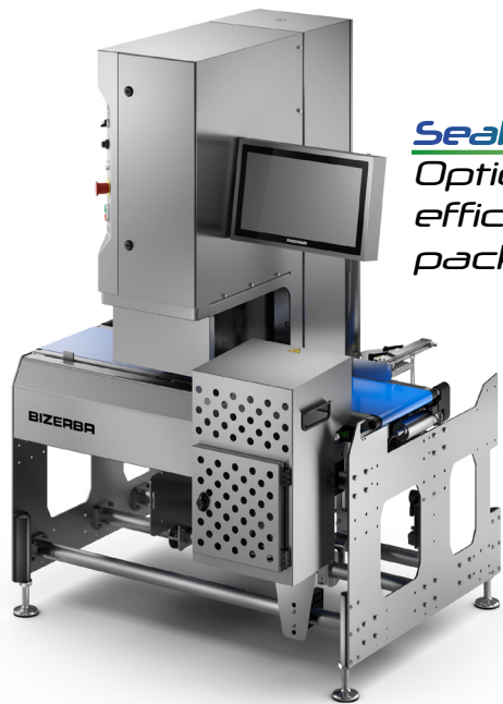
SealSecure: Optical inspection for efficient validation of package seals