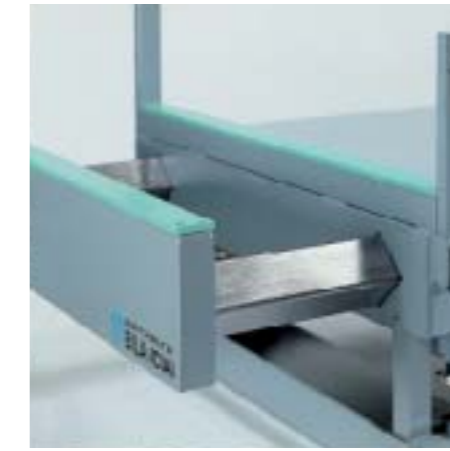
Extension Arms in platform with teflon