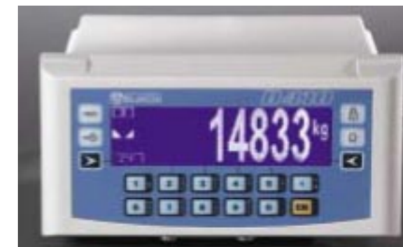
D410 weight terminal (optional printers available)