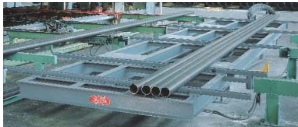
Special application by Cooperativa Bilanciai for weighing steel tubes in an automated line.