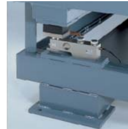
Anti-shock protection on loadcell arrangement