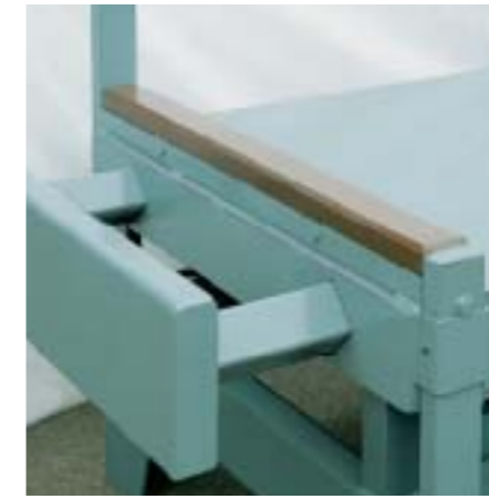
Extension Arms in platform up to 1m long